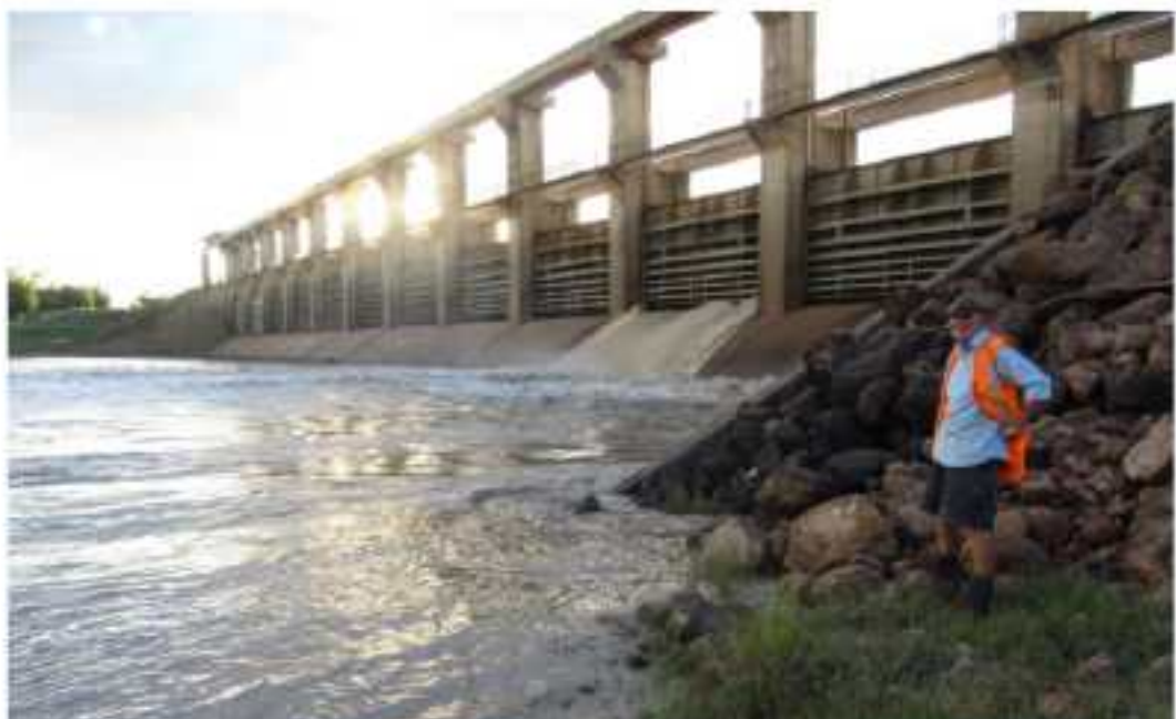
Enhancing water quality information for the Condamine Balonne Catchments